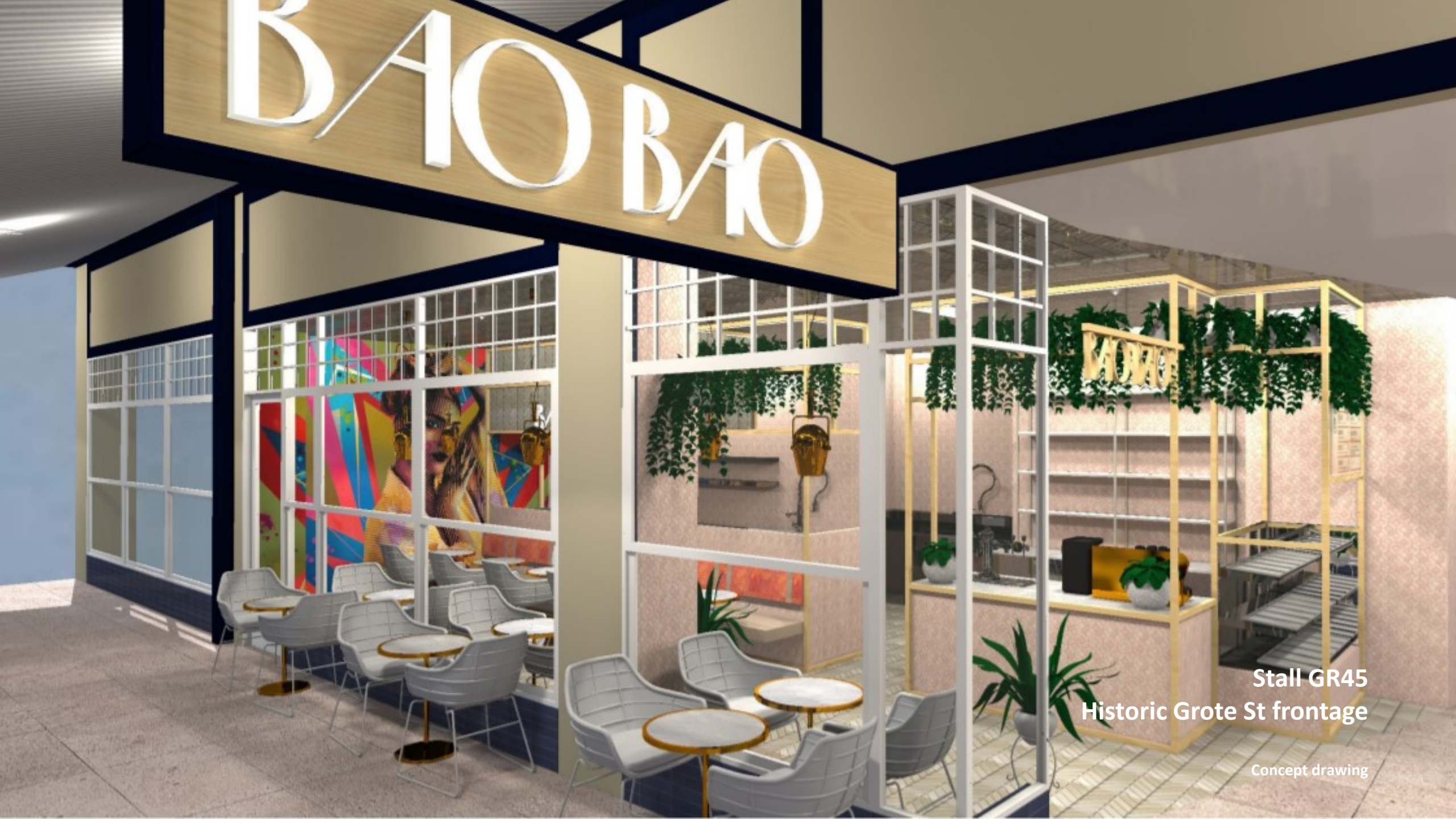
Stall GR45 Historic Grote St frontage